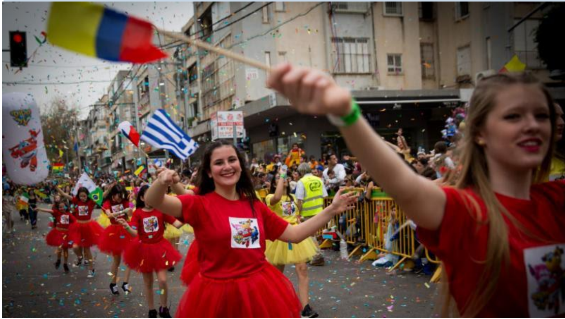
The Holon Adloyada Parade, Israel's Largest Annual Celebration of the Purim Holiday